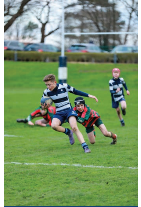
CROSS COUNTRY, NETBALL AND RUGBY AT DANES HILL