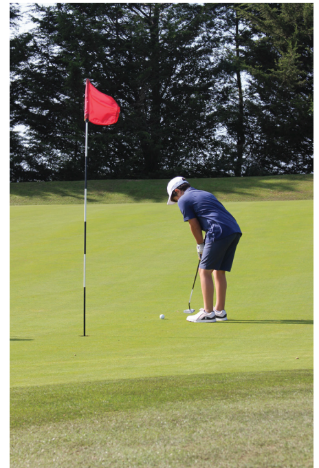
FOOTBALL, GYMNASTICS AND GOLF AT DANES HILL