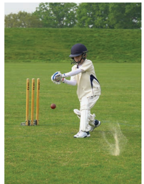
FOOTBALL, ATHLETICS AND CRICKET AT DANES HILL