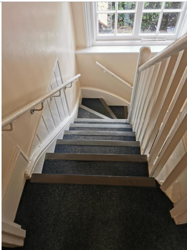
Pic: Bevendean top step